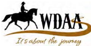
WESTERN DRESSAGE ASSOCIATION OF AMERICA