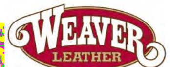
Official Tack and Equipment Supplier of IEA