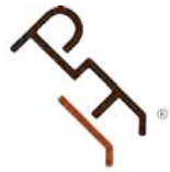
AMERICAN PAINT HORSE ASSOCIATION