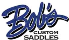
Official Western Saddle of IEA