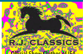
Official Show Clothes of IEA