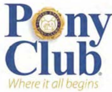
THE UNITED STATES PONY CLUBS, INC.