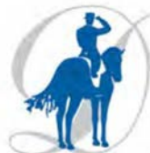
UNITED STATES DRESSAGE FEDERATION