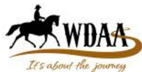
WESTERN DRESSAGE ASSOCIATION OF AMERICA