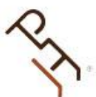
AMERICAN PAINT HORSE ASSOCIATION