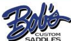
Official Western Saddle of IEA