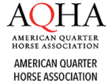
AMERICAN QUARTER HORSE ASSOCIATION