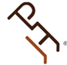
AMERICAN PAINT HORSE ASSOCIATION