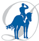
UNITED STATES DRESSAGE FEDERATION