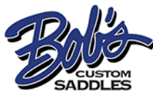
Official Western Saddle of IEA