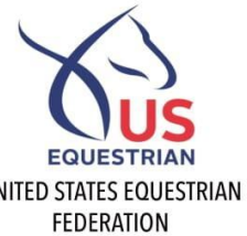
UNITED STATES EQUESTRIAN FEDERATION