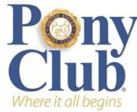
THE UNITED STATES PONY CLUBS, INC.