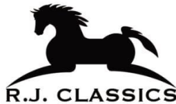
Official Show Clothes of IEA