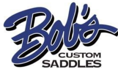
Official Western Saddle of IEA