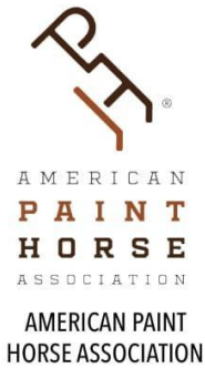
AMERICAN PAINT HORSE ASSOCIATION