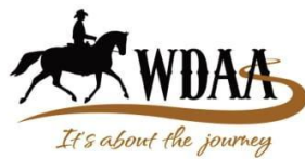
WESTERN DRESSAGE ASSOCIATION OF AMERICA