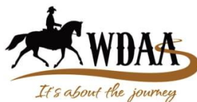
WESTERN DRESSAGE ASSOCIATION OF AMERICA