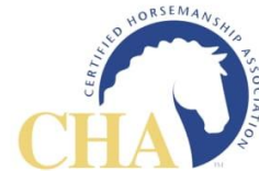
CERTIFIED HORSEMANSHIP ASSOCIATION