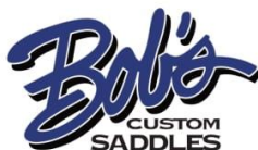
Official Western Saddle of IEA