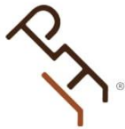
AMERICAN PAINT HORSE ASSOCIATION