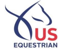
UNITED STATES EQUESTRIAN FEDERATION