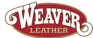
Official Tack and Equipment Supplier of IEA