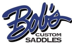
Official Western Saddle of IEA