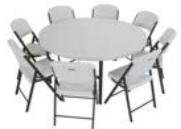
Table setups with 8 chairs are available on the ringside platform area in the Walker covered arena for $50 each. Reserve one for your team today on the stall reservation form. Payment may be included with your entry fees.