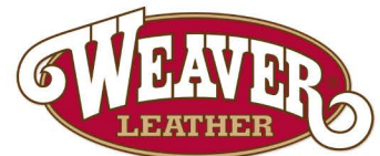
Official Tack and Equipment Supplier of IEA