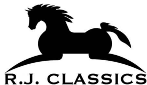
Official Show Clothes of IEA