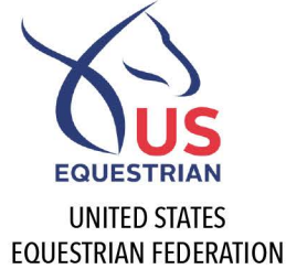
UNITED STATES EQUESTRIAN FEDERATION