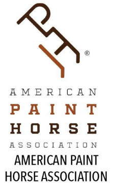
AMERICAN PAINT HORSE ASSOCIATION