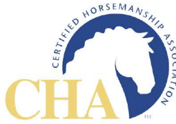
CERTIFIED HORSEMANSHIP ASSOCIATION