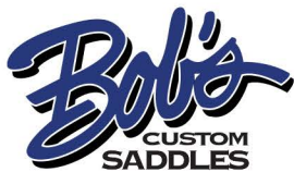
Official Western Saddle of IEA